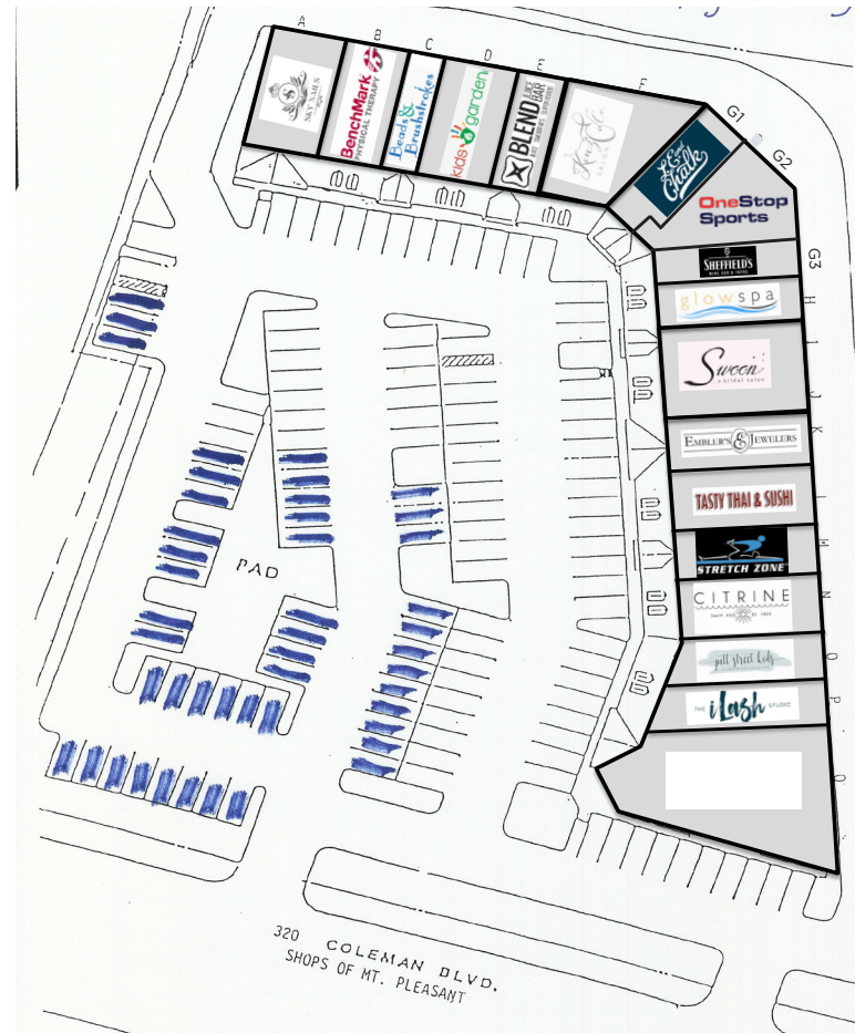
Shops of Mt. Pleasant – Site Plan