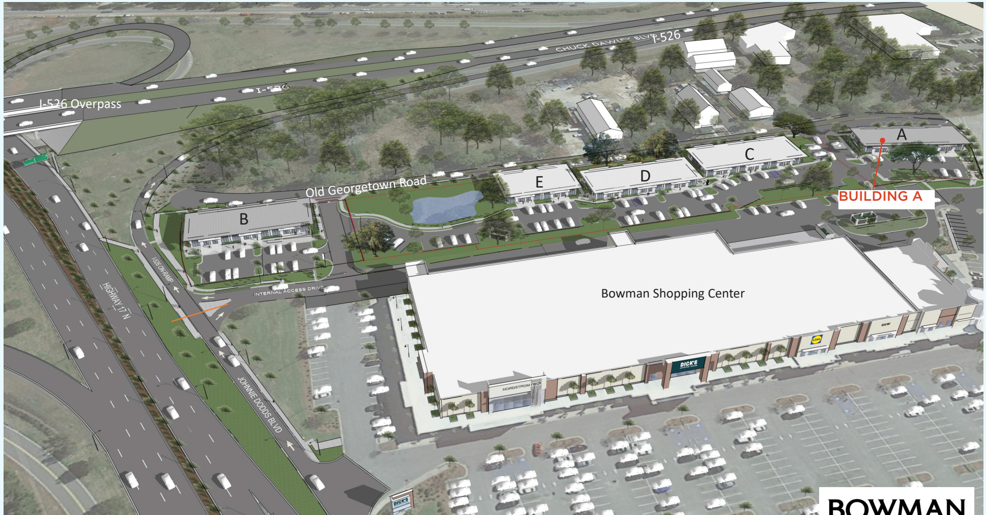
Birds eye view East